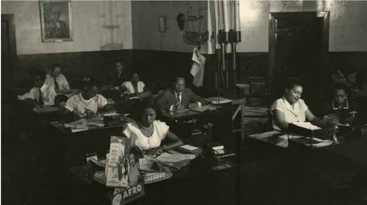
Archival photo - Courtesy of the Afro-American

by just under 60% since 2000 and more than 2,000 newspapers have shuttered since 2004. But print journalism's decline isn't a headline, Draper said. It's been a documented trend for more than two decades. That's why journalism doesn't need a hand out, like a stimulus. It needs a hand up, like a policy that augments and incentivizes the existing revenue-generating behaviors that support local journalism — a policy like the Local Journalism Sustainability Act.