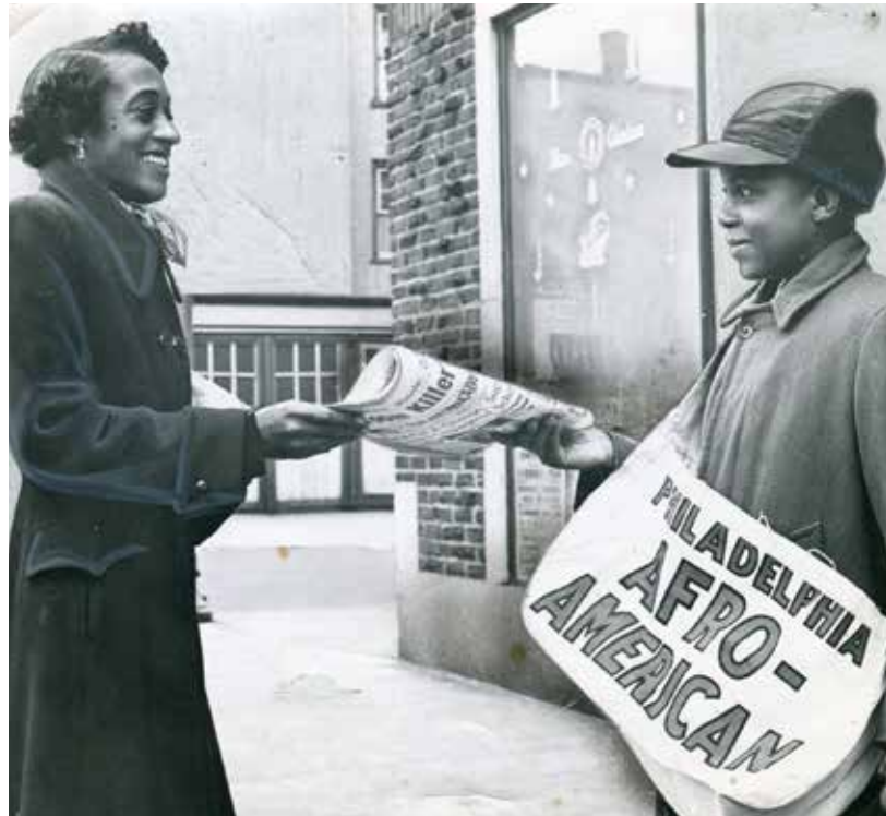
Archival photo

Anyone who has been following the plight of local newspapers in recent decades knows the statistics. Newspaper jobs have fallen